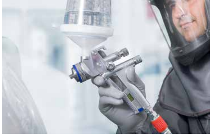
A uniform and flexibly adjustable spray fan according to the specific requirements – the SATAjet 5000 B for perfect finishes