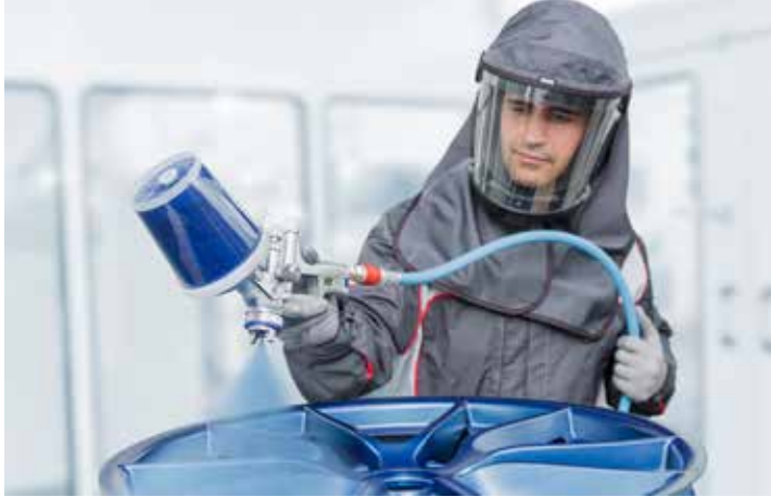
Enhanced ergonomic design – the SATAjet 5000 B with optimised gun handle contours suiting every palm